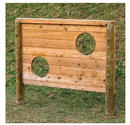
Order No. L6.99000 Ball Wall, technical changed