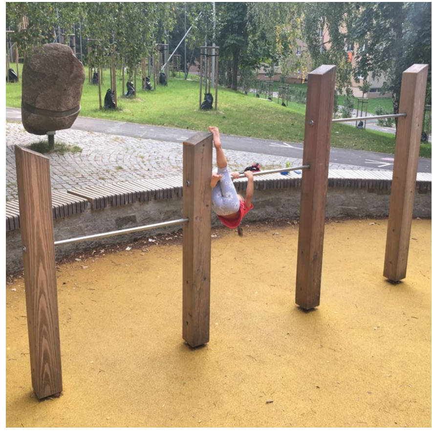
Order No. L6.96000 Horizontal Bars in different heights, special version made of square timber Horizontal Bars in different heights