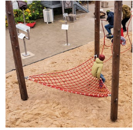
Order No. L6.51642