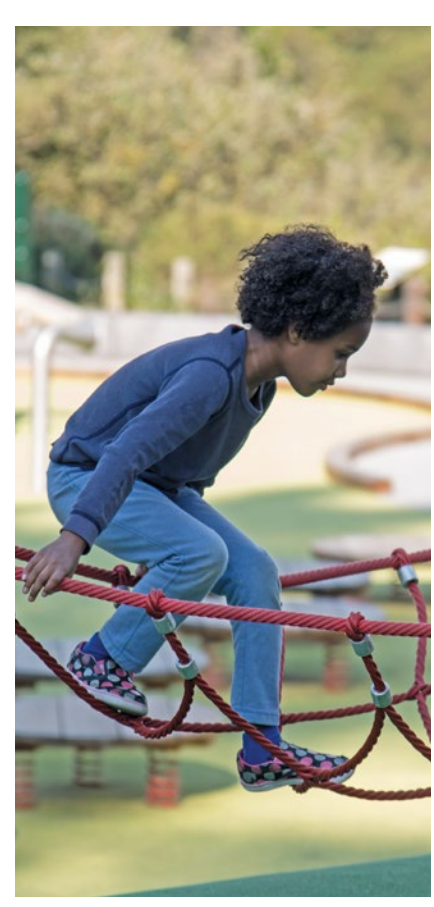
Order No. L6.51640 Horizontal triangular net, wide-meshed, Photo © Daniel Perales

The horizontal net structure is a nice challenge even for smaller children who like to try out their artistic skills and sense of balance. As the net provides enough space to accommodate many children at the same time, it is well suited for heavily frequented playgrounds. The horizontal net surface also invites them to take a short break before resuming play activities.