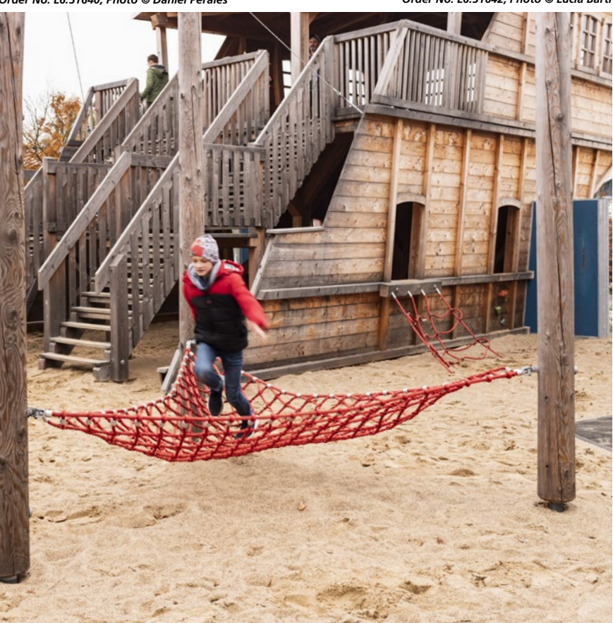
Order No. L6.51642 with fine-meshed net