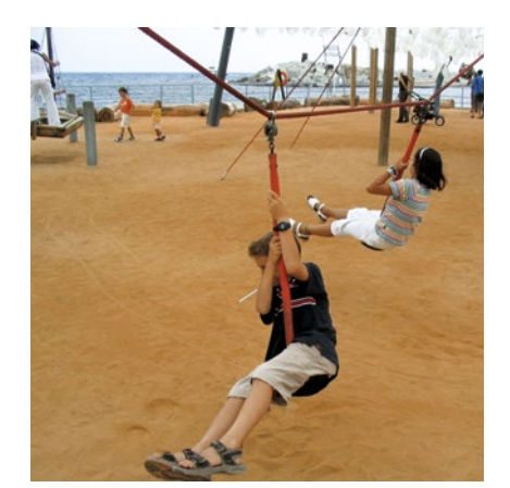
Special version with square timber