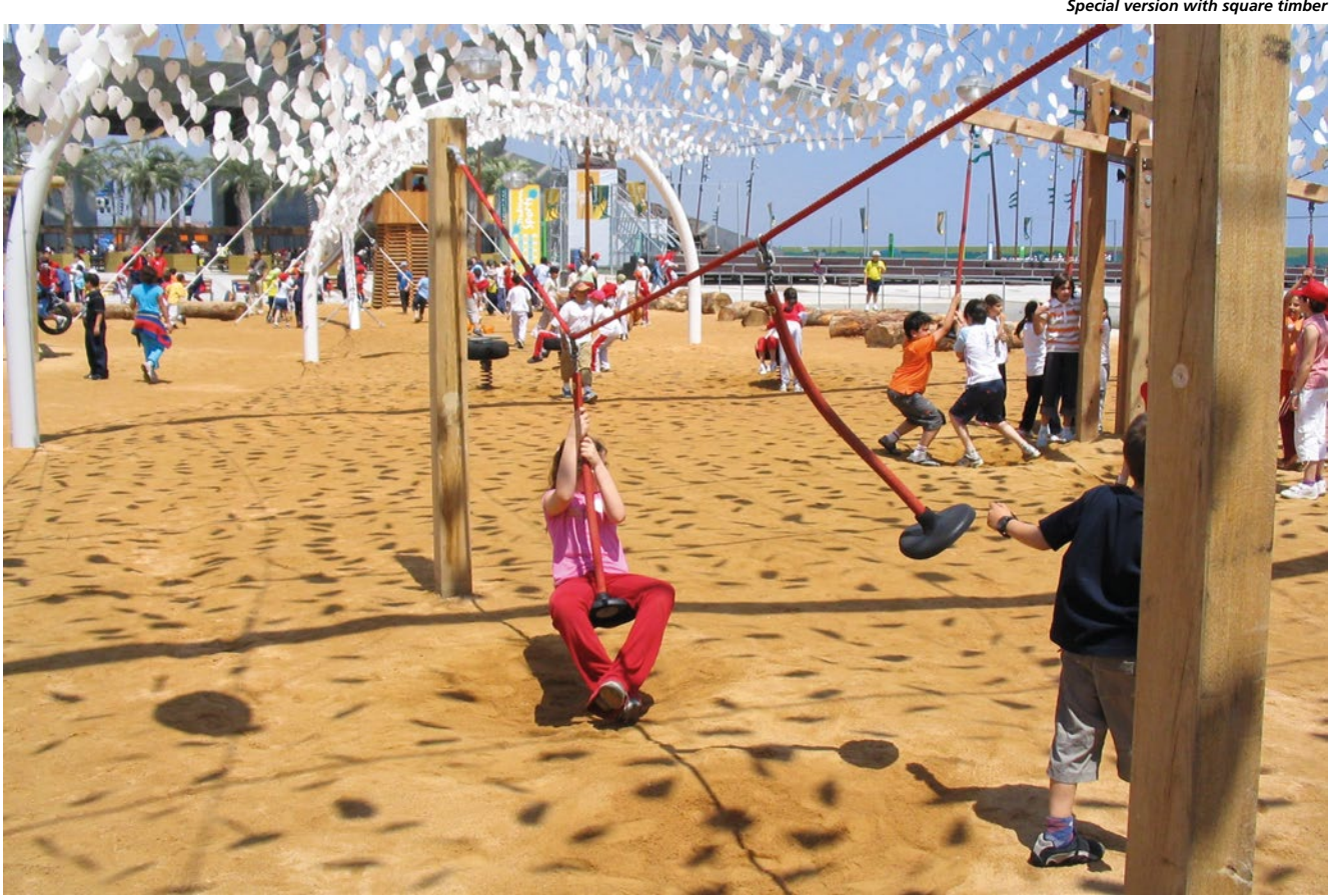
Special version with square timber