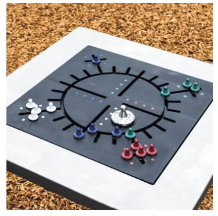
Order No. 9.11010 Catch me if you can – Table

Our "Catch me if you can" games are suitable for two to four people of all age groups. All games can also be set up outdoors. The players bring their own chess pieces. The "Nine Men's Morris" pieces differ by their colour, the pieces of the "Catch me if you can" game by their different feel – the surfaces are grooved or smooth. The pieces can be easily moved through the lanes, but cannot be removed.