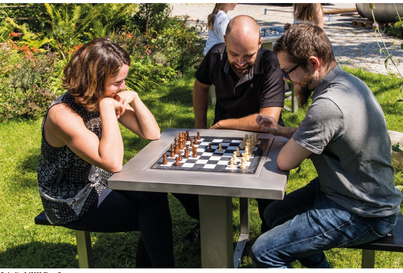
Order No. 9.12000 Chess Game