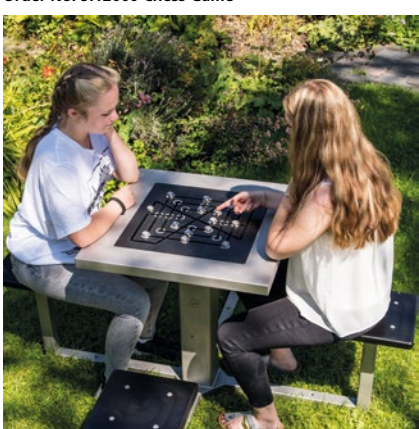
Order No. 9.14000 Nine Men's Morris Game