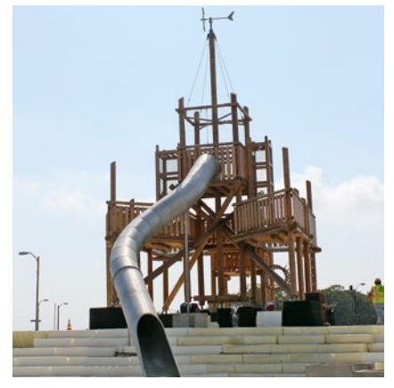
Tunnel slide is not included in the components.