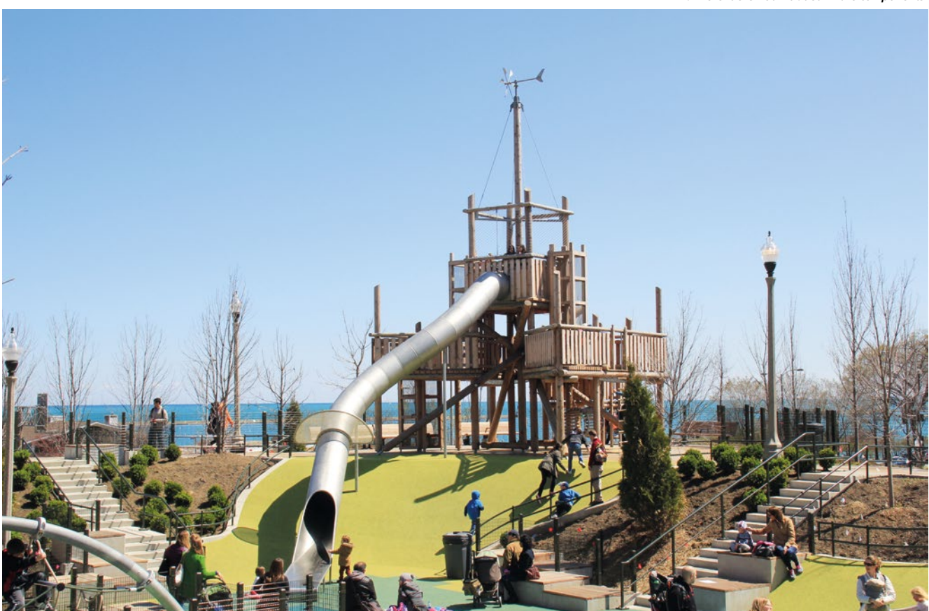
Tunnel slide is not included in the components, Photo © Daniel Perales