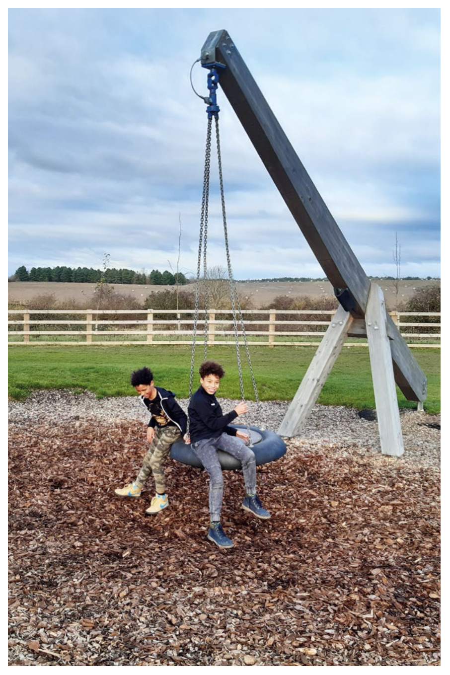
Tractor Tyre Swing