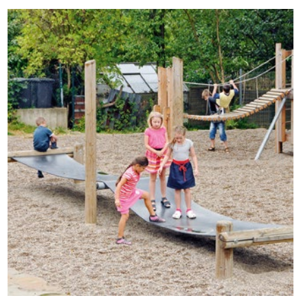
Special version, posts made of round timber