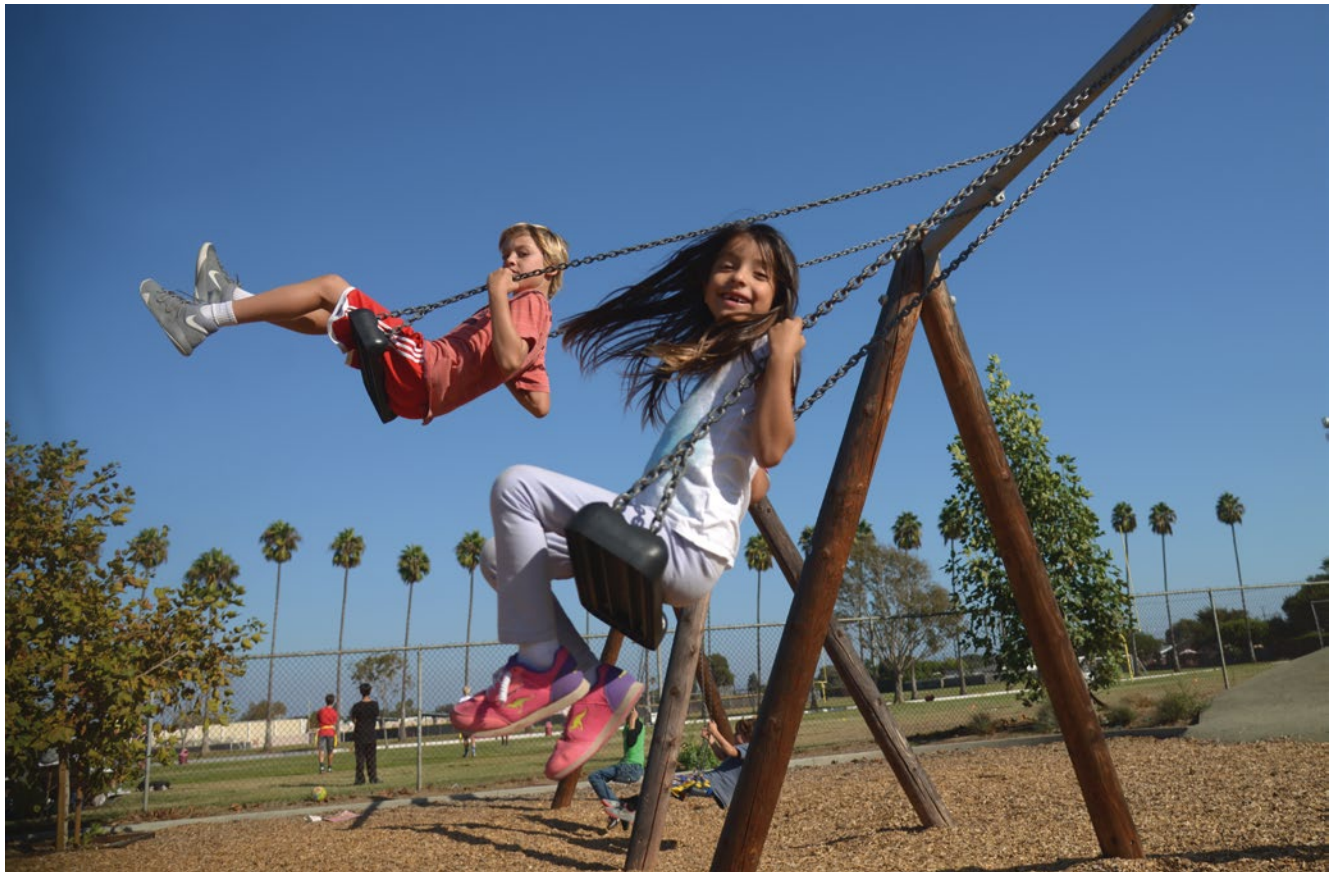
Order No. 6.14020 High Twin Swing special, Photo © Daniel Perales