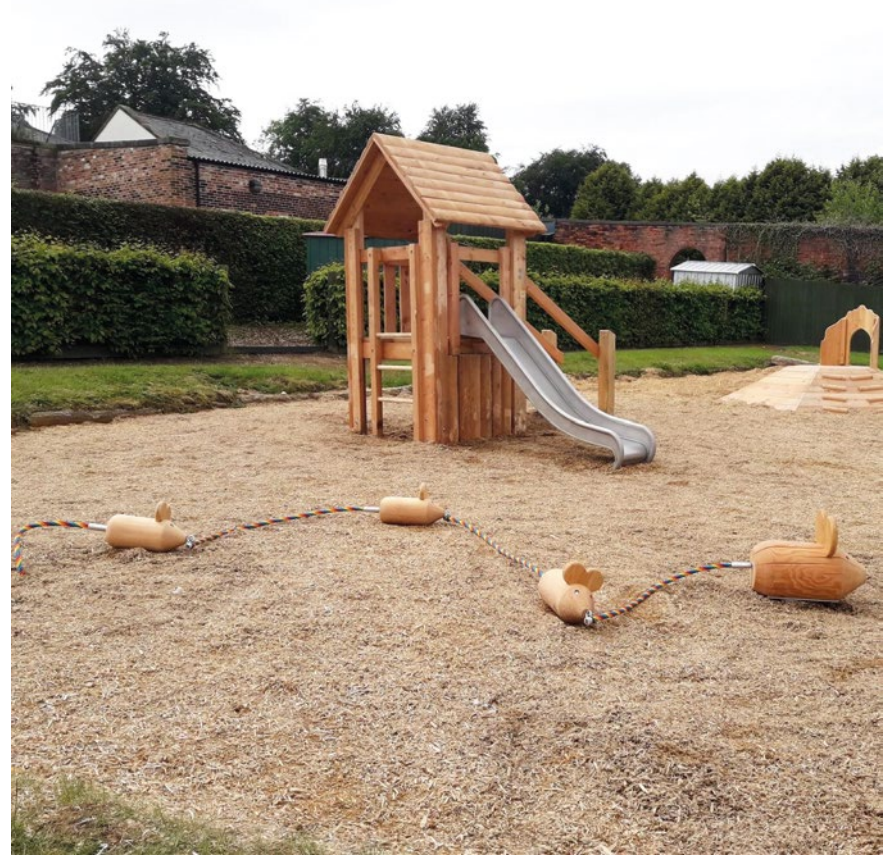
Special version, mice without colour