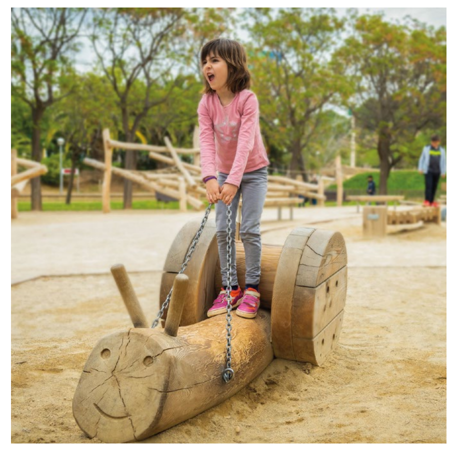
Snail Little Snail