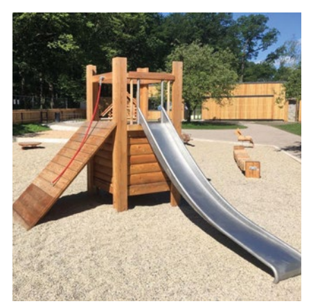
Order No. 3.13100 Platform Hut