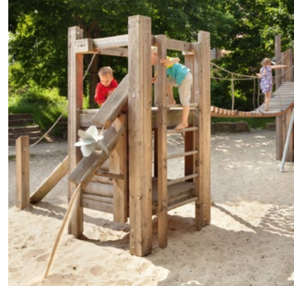
Order No. 3.13100 Platform Hut