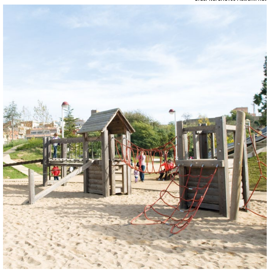
Order No. 3.14350 Small Platform Hut with roof and 3.14150 Small Platform Hut with each 2 walls, 2 benches, 1 table Huts for combination