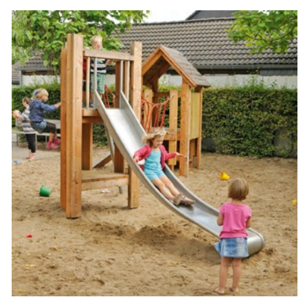
Order No. 3.12300 Triangular Hut