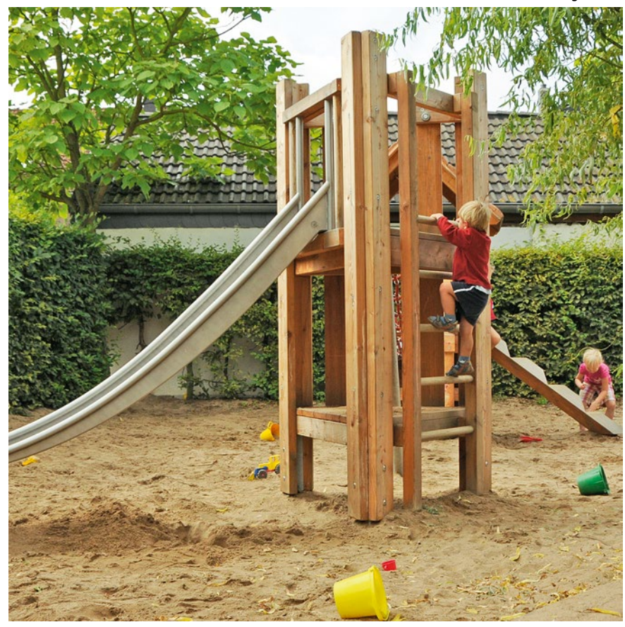
Order No. 3.12300 Triangular Hut