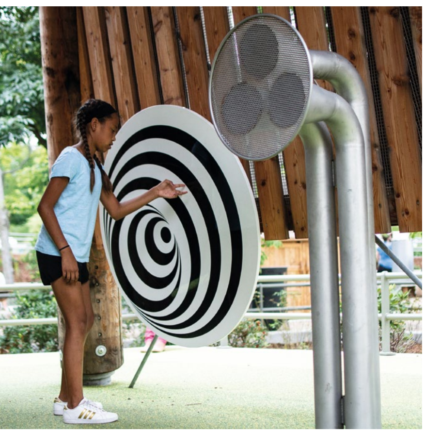
Order No. 10.55100 Echo Game with Order No. 10.22500 Rotating Disc, Photo © Daniel Perales