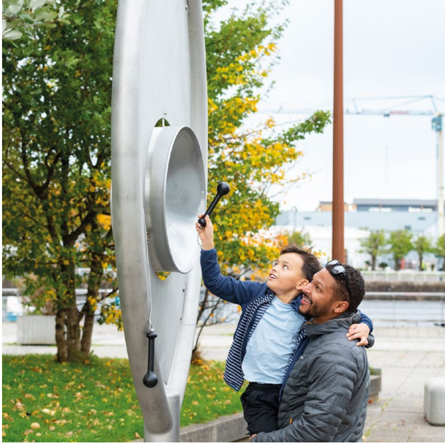
Order No. 10.54200 Steeldrum