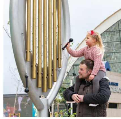
Order No. 10.54100 Sound Tree