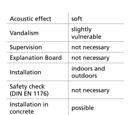
Tubular Dendrophone - single field Tubular Dendrophone - double field