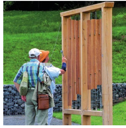
Order No. 10.53102 Tubular Dendrophone - double field