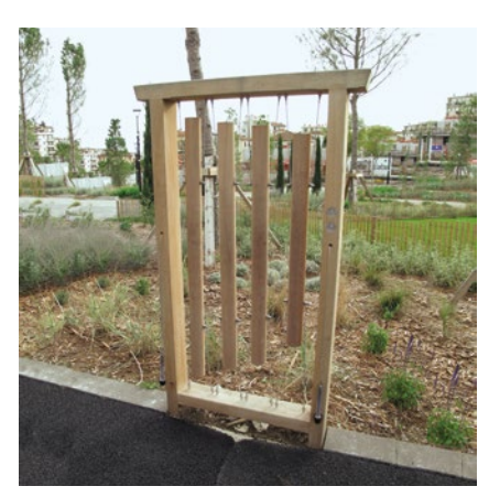
Order No. 10.53100 Tubular Dendrophone - single field