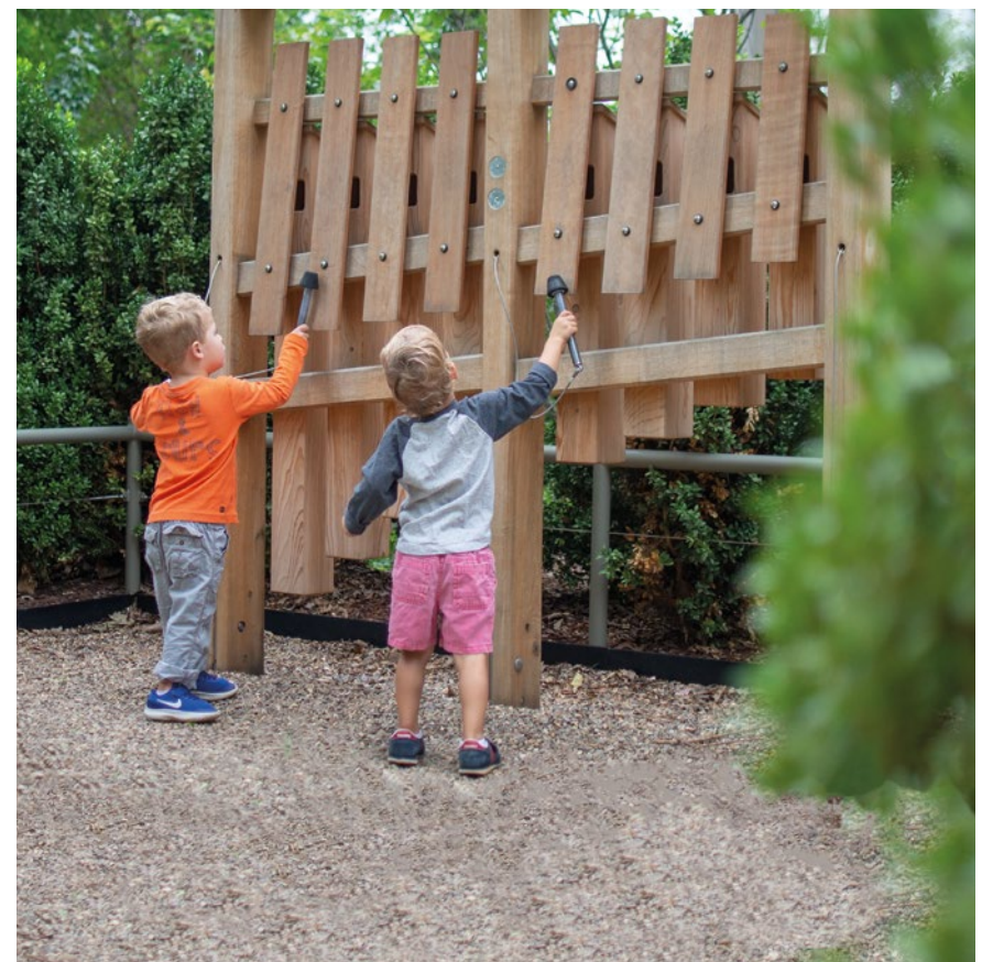
Order No. 10.53002 Dendrophone - double field