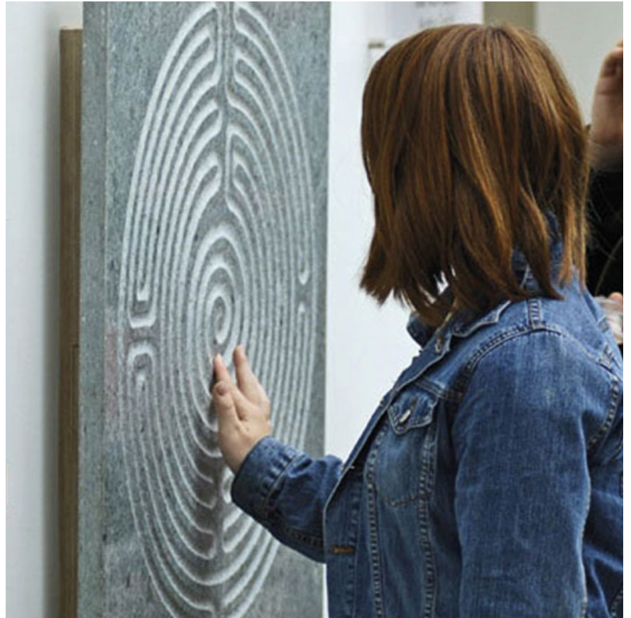
Order No. 10.14500 Fingerlabyrinth for wall attachment

Fingerlabyrinth for wall attachment Fingerlabyrinth with stand frame made of stainless steel graubner Play Stations for Developing the Senses